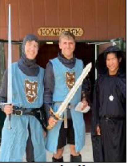
Catholic Adventure Camp

In the Games, campers complete contests and challenges to help their team win the St. Kateri Cup. Outdoor play includes capture the flag, archery, an epic water fight, and a variety of group games. Daily encounters with our Lord includes Mass, Reconciliation, prayer, and Adoration under the stars.